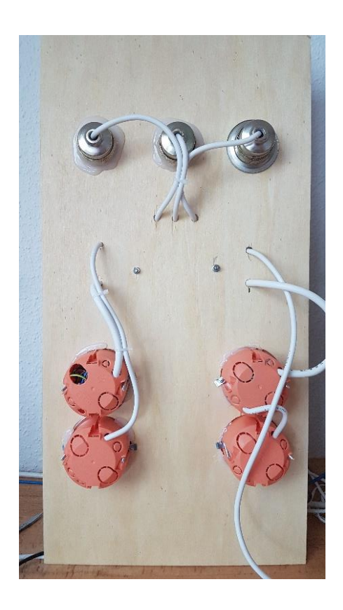
Module 2, Back