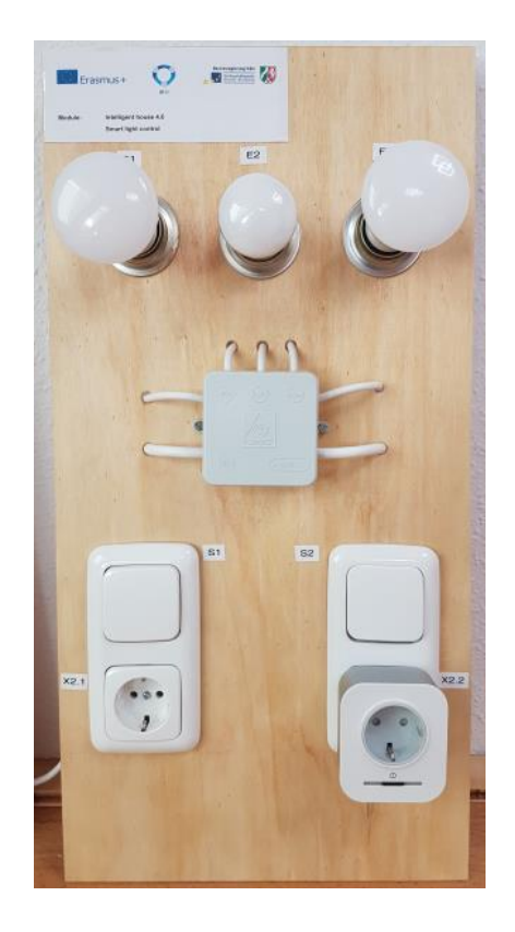
Module 2, Front with 2 Phillips Hue Bulbs and smart plug

The light source E2 is connected via a conventional changeover circuit with the changeover d to phase L1 without a switch.