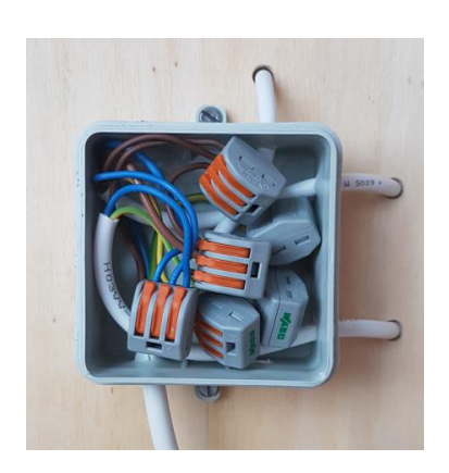
Module 1, Wireing